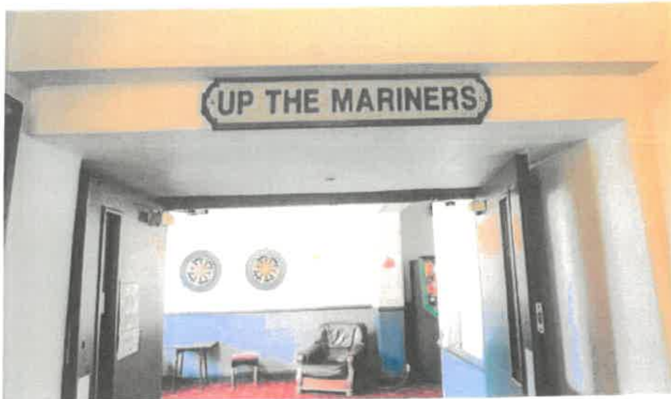
Up The Mariners is the mantra at the Mariner's Rest