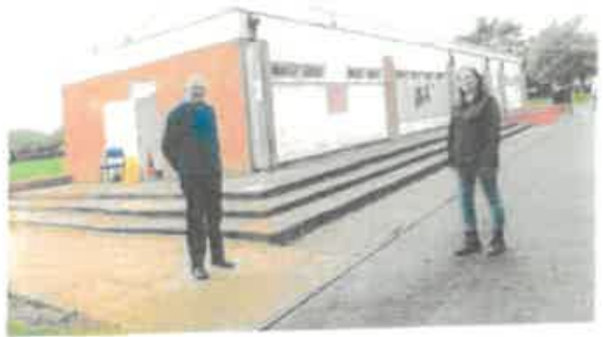
Popular Cleethorpes park to get new family cafe and sports pavilion