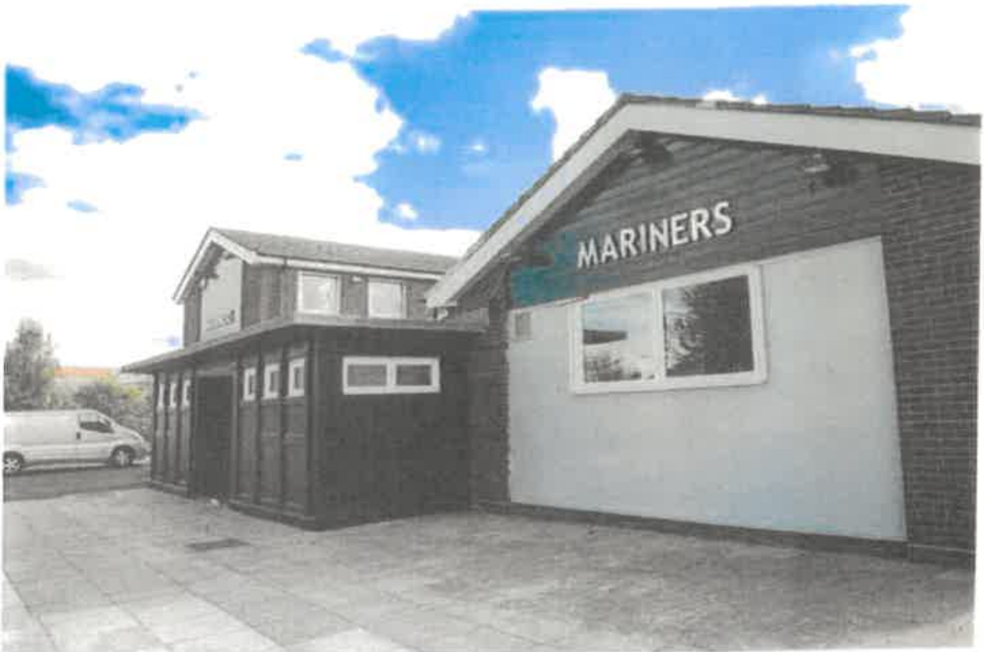
The Mariners' Rest on Albion Street in Grimsby is back open under a new owner