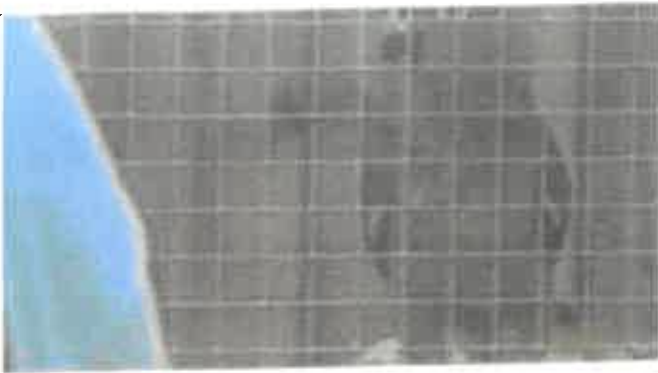
Lincolnshire's singing parrot appears on This Morning - and impresses Holly Willoughby and Philip Schofield