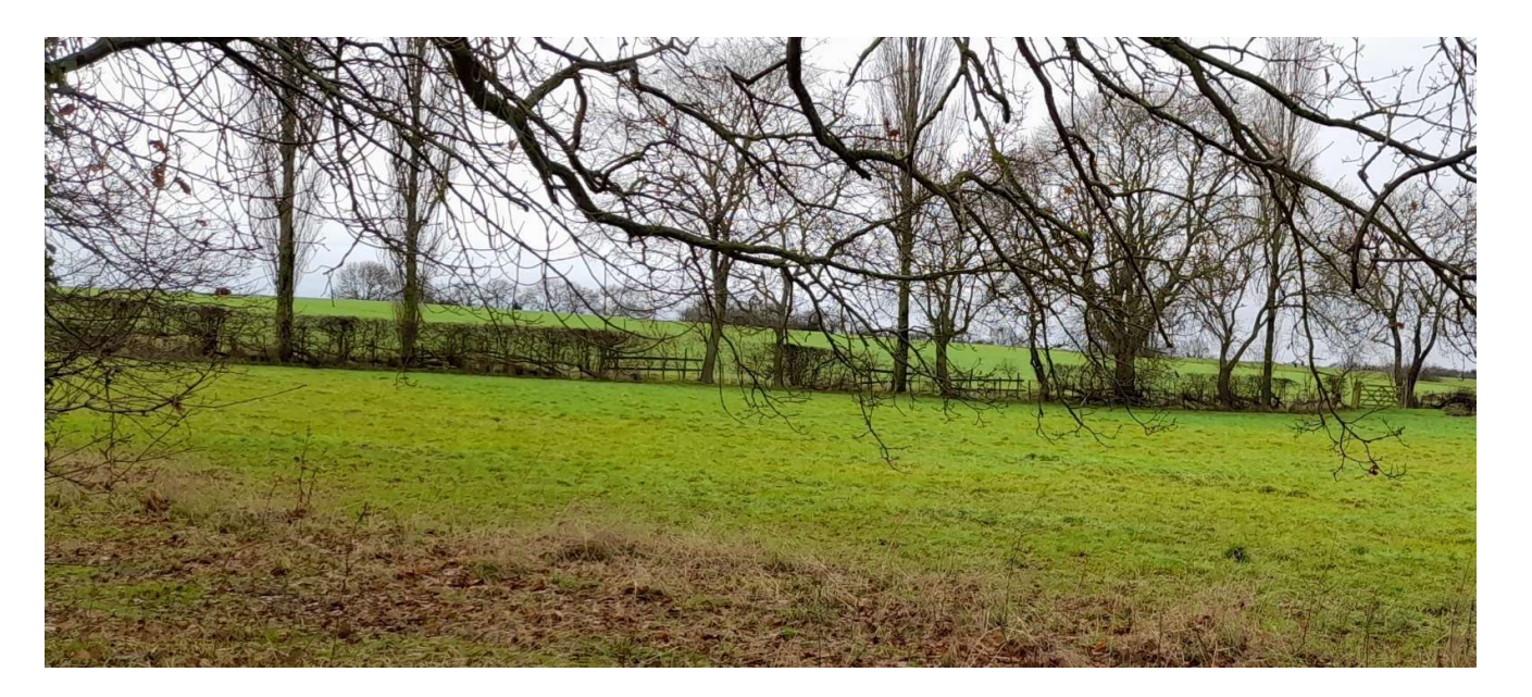
Field Fence NE