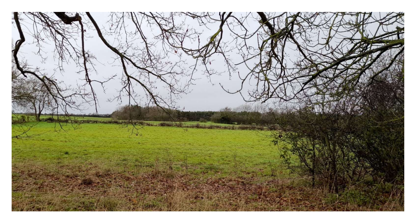
Field Fence SW