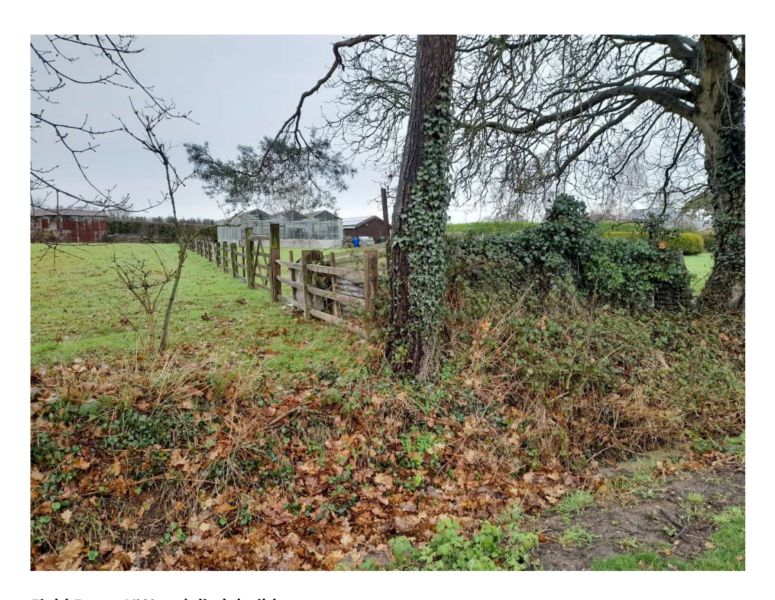
Field Fence NW and ditch build up