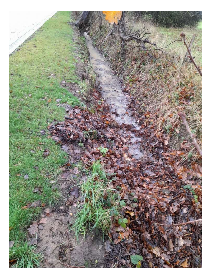
Ditch build up