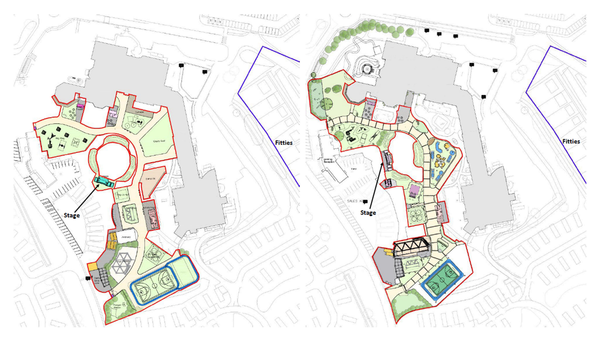
Original planning application DM/1037/21/FUL submitted on 12^{\rm th} October 2021